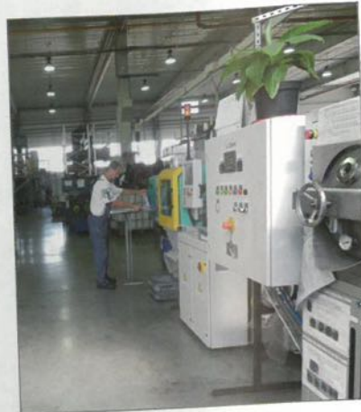
The Gevorkyan s. r. o. MIM facility