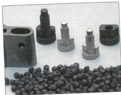
MIM parts produced by Gevorkyan s. r. o.