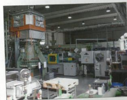
The Gevorkyan s. r. o. MIM facility